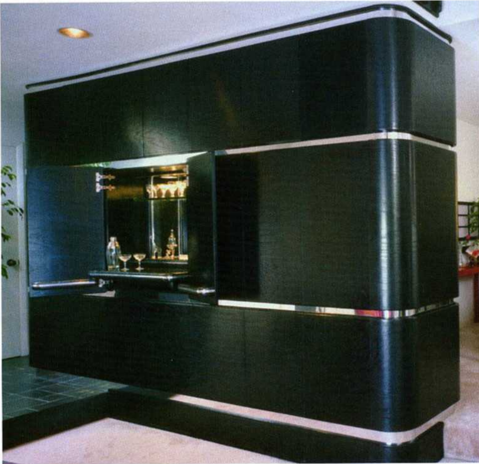
(Above) The panels on this unit open to reveal a bar, entertainment center and other storage.