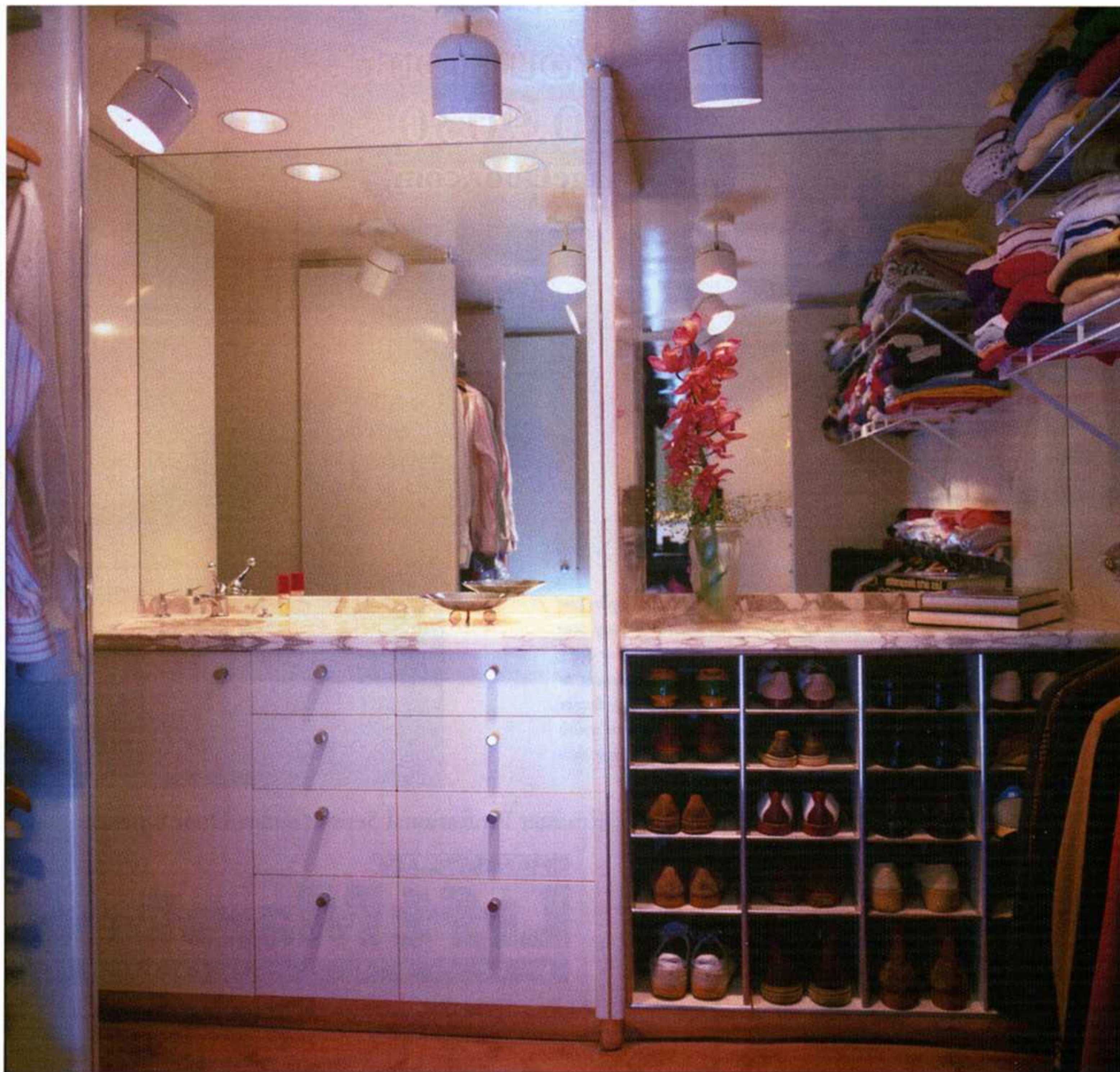
A custom closet

ago, relocated his shop to its current location on Gaskill Street. To complete his commissioned pieces, he keeps the doors of his studio open six days a week.