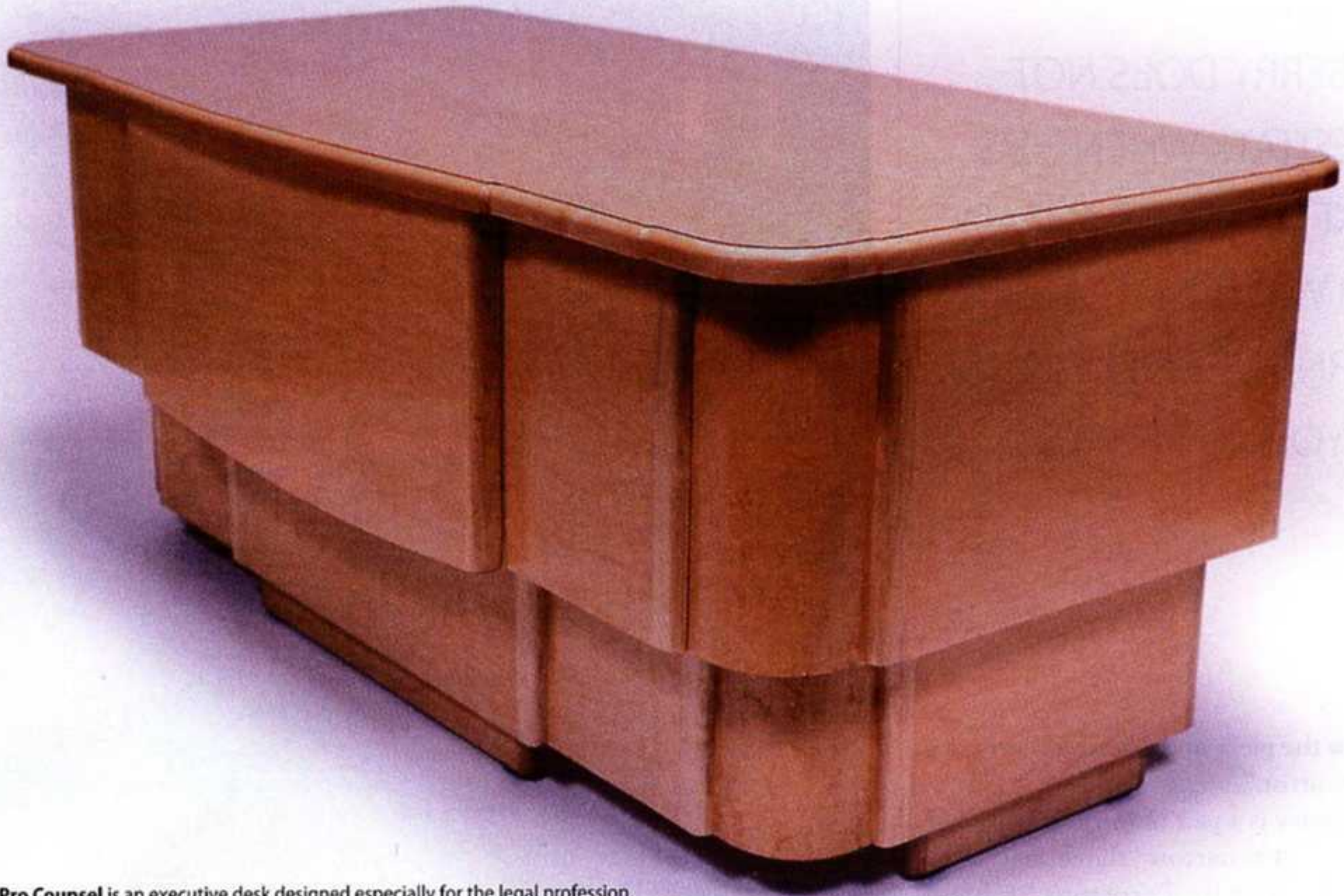
The Pro Counsel is an executive desk designed especially for the legal profession.